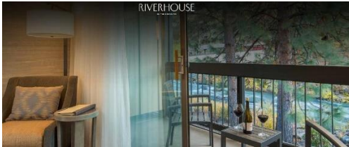
Balconies overlooking River

Transfers: Trip package includes shuttles to take us to-and-from the Riverhouse to Mt Bachelor each morning at a couple of times in the morning and a couple of times returning in the afternoon. The shuttles are also available to take us into historic Bend, Oregon. However, depending on how late you stay out you may need to Uber, Lyft or Taxi back. The Riverhouse is approximately 1.2-1.4 miles to downtown. The last time we stayed at the Riverhouse , some of the Participants talked with the front desk and arranged a shuttle to see the Bend Museum and Deschutes Brewery tour and explore downtown Bend, on one of their day-offs. Your Trip Leaders and yourself, will help make the most of the Trip.