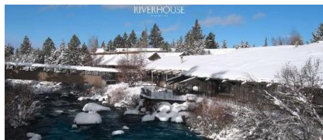
the Riverhouse on the Deschutes River