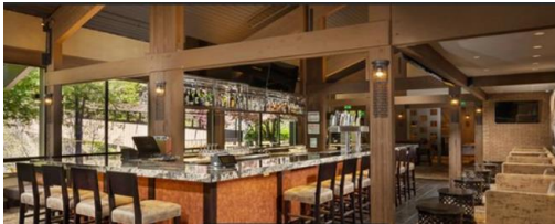
Onsite: Currents Bar & Restaurant