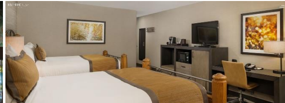
Twin Queen Beds for 2 per Room

Flights and Arrival: Trip package includes airfare with Alaska Airlines from MSP to Seattle to Redmond, OR. Redmond is the next town over, and a 15 -20 minute ride to the hotel, shuttles will meet us at arrival in Redmond.