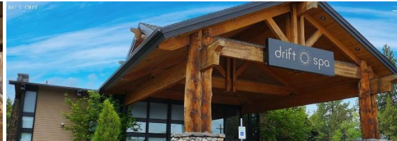
Onsite: Drift Spa

Local Contacts: As on other 3M Ski Club trips, we will have local contacts that will ski with us during the week, from Beginner - to - Blues Cruisers - to - Advance, and to areas less traveled that would be fun to explore, bowls and trees. Our Local Contacts will help with our questions during the week on Skiing/Boarding, Dining, activities, suggested day trips, and what trouble you can get yourself into, however it may cost you a few drinks.